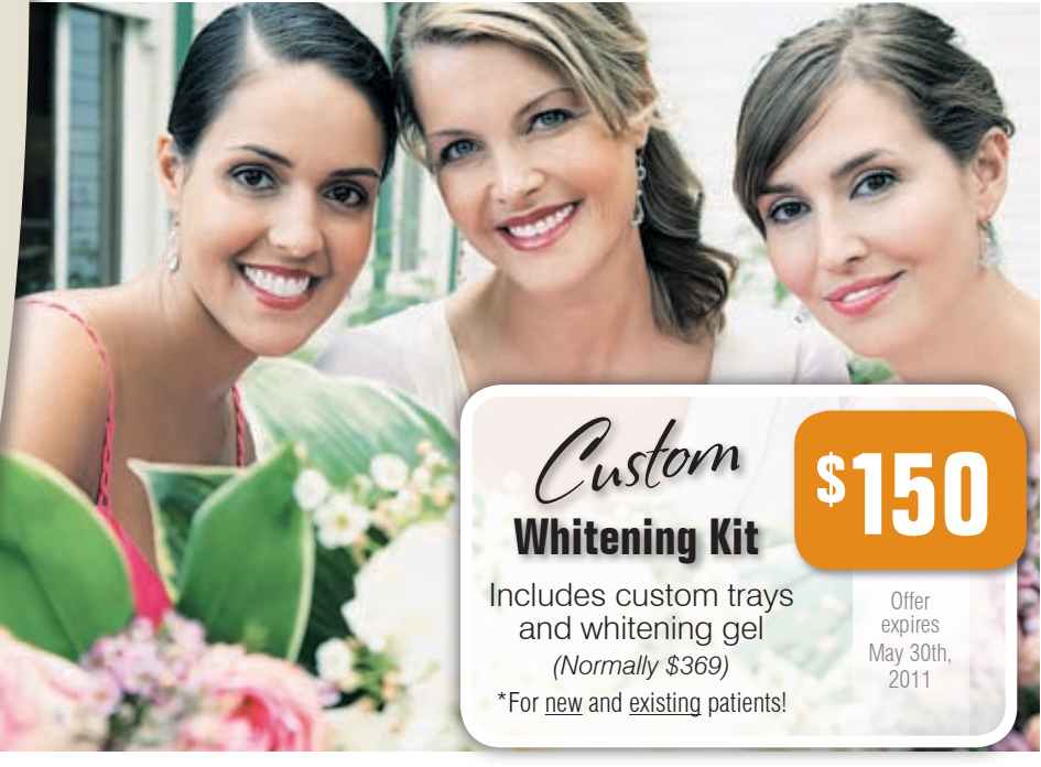
Making gorgeous smiles affordable

Call today to book your free consultation. We have plenty of time to talk about your wedding smile. And in fact, please extend our offer to your entire wedding party. We'll make every page in your wedding album burst with spectacular smiles!